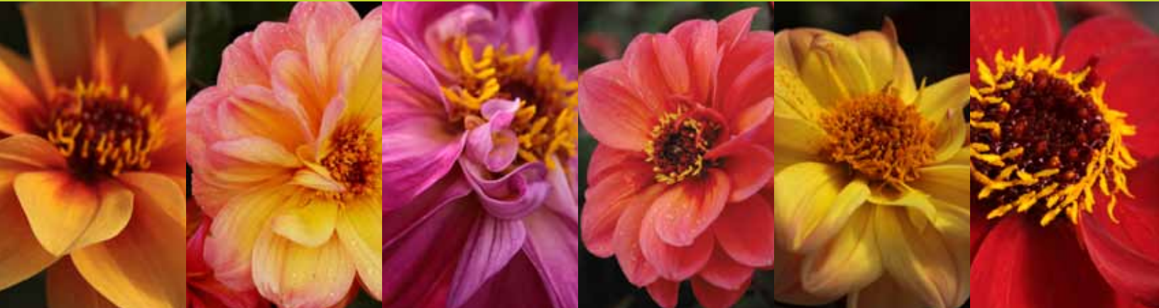
From left: Dahlia Dreamy Eyes, Fantasy, Fusion, Inspire, Moonlight, and Passion

A care-free, robust series for containers, window boxes or planted in the garden. Perfect size for a dahlia series – neither “short & dumpy” nor “big and rangy” – great for sale in quarts or gallons, with excellent presentation and retail appeal. Will work well in mixed containers or bedding for the consumer and flower non-stop from April until frost, never missing a beat. Tubers can be taken up in autumn and stored frost-free.