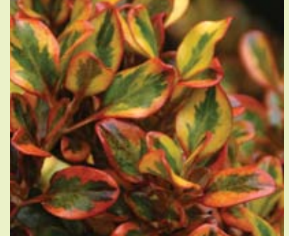
COPROSMA repens 'Tequila Sunrise' PP18392

An excellent new sister variety to the bestselling Coprosma, Tequila Sunrise, this golden-leaved plant becomes suffused with orange when nights are cool. Excellent in mixed containers, 4" and gallons.