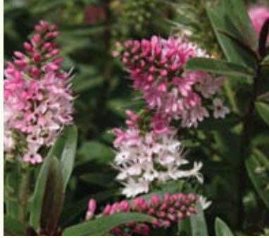
HEBE hybrid 'Strawberries and Cream' PPAF

An excellent, compact, green-leafed Hebe that gets covered in pink blooms in late spring. Trim it back for a repeat performance in late summer/fall. Great in 4", quarts and gallons.