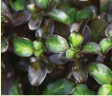
COPROSMA repens 'Martini Midnight' PPAF

The uniform, consistent habit of the Cocktail Series make these three varieties the perfect choice for 4' to 6' pot production. Excellent in mixed containers or as specimens, they command a premium at retail with their unusual color and texture with a tidy habit. Cool night temperatures enhance foliage colors.