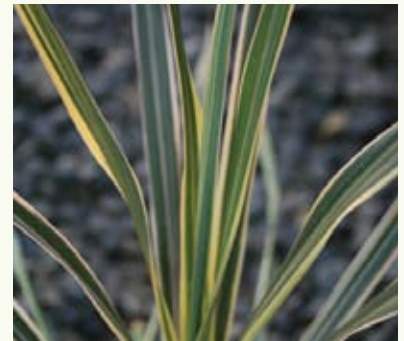
CORDYLINE australis 'Torbay Dazzler'

This showy and vigorous plant has very dark reddish-bronze, sword-like leaves. Upright habit and with age will branch to produce several heads.