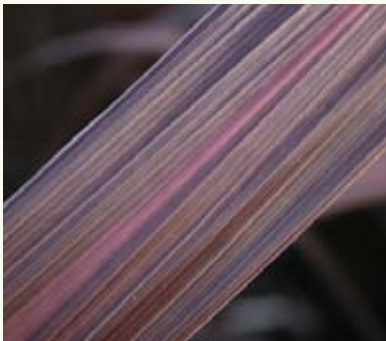
CORDYLINE australis 'Red Sensation'

We adapt our offerings to best take advantage of the best-performing varieties available from our most reliable labs. We offer both proven varieties as well as the more unusual and harder-to-find selections. Our Cordyline program is designed to provide a well-grown plant that will grow quickly and appeal to both retailers and consumers.