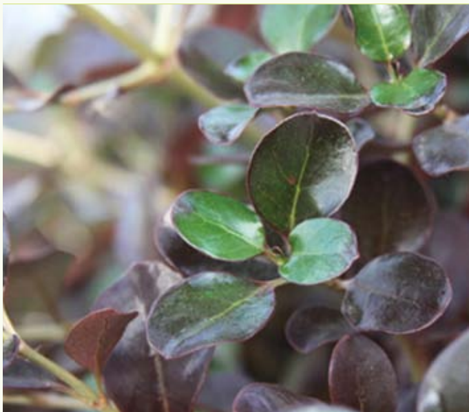
COPROSMA repens 'Plum Hussy'

This plant is our #1 seller. Stunning foliage changes from lime-green and yellow in the spring to sunset-orange and burgundy as the weather cools. Excellent in 4", quarts and gallons.