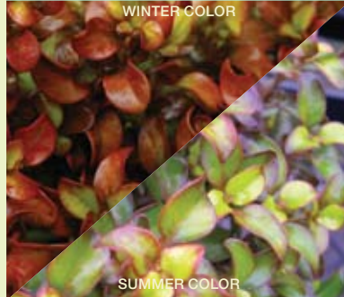
COPROSMA repens 'Piña Colada' PPAF

This all-black version of our most popular variety, Tequila Sunrise, is sure to be a hot seller. Its dark foliage becomes almost black under cool temperatures, and when paired with Tequila Sunrise and its sister variety Piña Colada, the three of these, together, are sure to be even more popular. Excellent in 4" and 1 gallon pots.