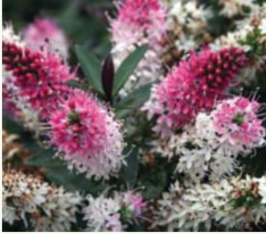
HEBE hybrid 'Raspberry Ripple' PPAF

Nothing to worry about with our group of evergreen Veronica. Hebe are exceptionally easy to grow. The plants have a bushy, upright habit and attractive, narrow, spear-shaped green leaves. It's the blooms, however, that are the big story. The dense sprays of flower clusters in various shades of lilac are gorgeous. Blooms under short days of spring and fall. Very butterfly friendly. Plant in well-drained soil.