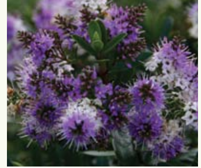
HEBE speciosa x diosmofolia 'Inspiration'

An excellent, compact, green-leafed Hebe that gets covered in pink blooms in late spring. Trim it back for a repeat performance in late summer/fall. Great in 4", quarts and gallons.