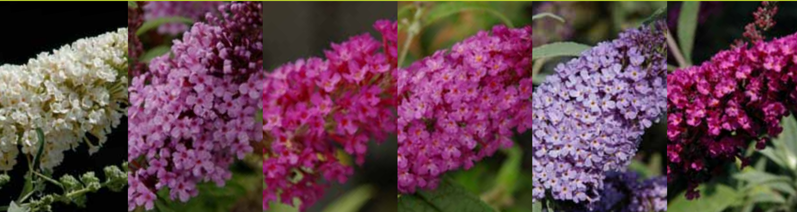
From left: BUZZ Buddleja Ivory, Lavender, Magenta Improved, Purple, Sky Blue, and Velvet

The BUZZ™ Buddleja series is a superb performer for both grower and gardener. Bred to be compact – one-third the size of standard Buddleja – these varieties make beautiful pots and containers and flower quickly from liners in 1-gallon or larger pots.