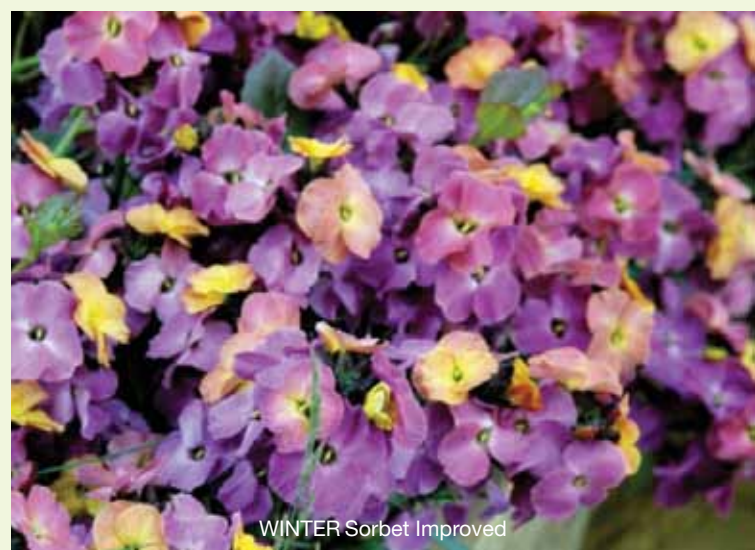
WINTER Sorbet Improved