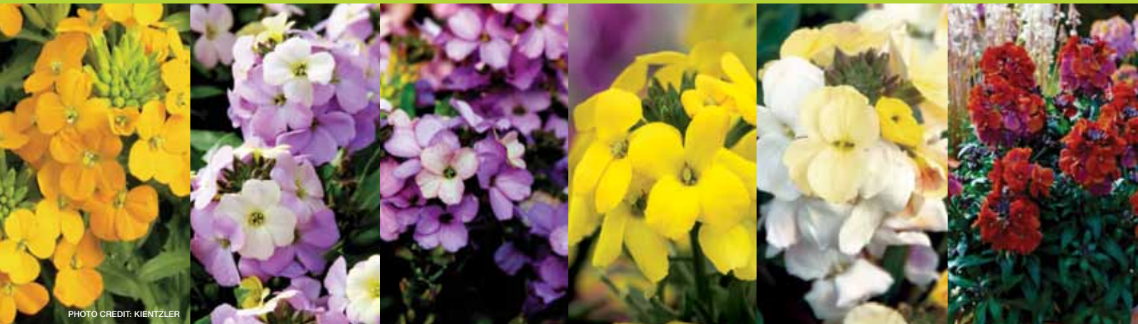
From left: Erysimum Orange GLOW™ , POEM Pastel , POEM Lavender , RYSI Gold , RYSI Moon , WINTER Rouge

These four new Erysimum series have been created by crossing many different species with the goal of having more colors, better plants and longer flowering. The value of these hybrid varieties is that they can be grown very much like a fall Pansy or Regal Geranium and will bloom nonstop for months. Start them warm and then grow cold to initiate flowers for a profitable, early-spring sale.