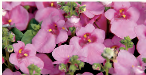
MARSHMALLOW Rose PPAF