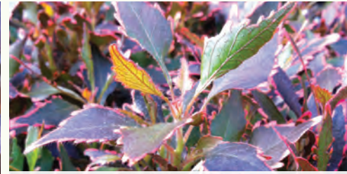
ACALYPHA TIKI Tropical Typhoon