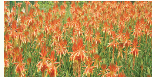
ALOE Topaz PPAF