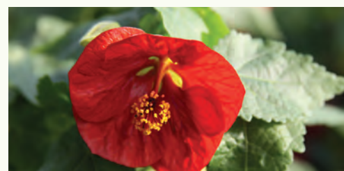
ABUTILON LUCKY LANTERN Red