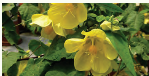
ABUTILON LUCKY LANTERN Yellow