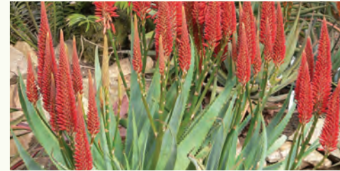
ALOE Super Red PPAF