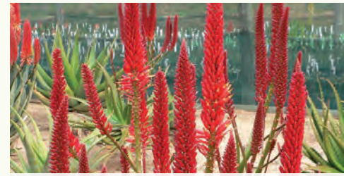
ALOE Erik the Red PPAF