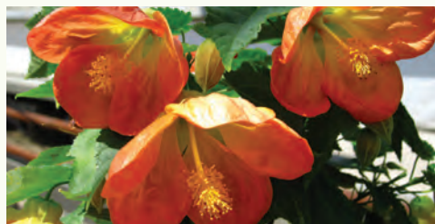
ABUTILON LUCKY LANTERN Tangerine