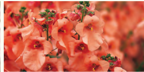
MARSHMALLOW Apricot PPAF