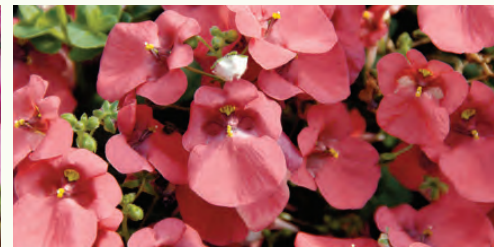
MARSHMALLOW Flamingo Raspberry PPAF