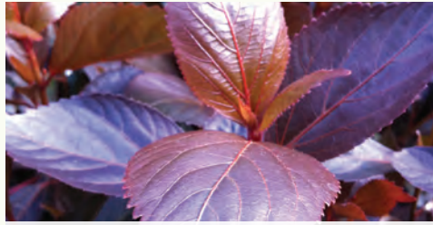
ACALYPHA TIKI Lava Flow