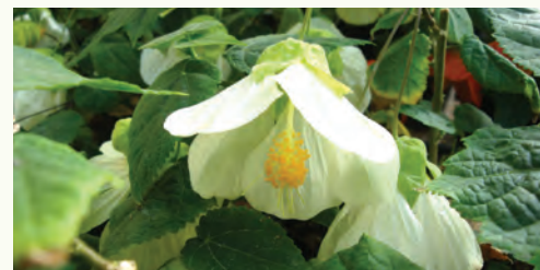
ABUTILON LUCKY LANTERN White