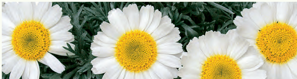
LEUCANTHEMUM HOSMARIENSE Flirt

This exciting early spring bloomer has stunning silver foliage with beautiful white flowers. A superior new selection with much larger, extremely long-lasting flowers, it can be grown with Erysimum, planted in late summer or fall and grown cool over winter. Its stunning silver leaves remain beautiful all summer, even after the early spring flowering season. PGR when flower buds are the size of a pea with Bonzai or B-Nine. Peak availability weeks 25-5.