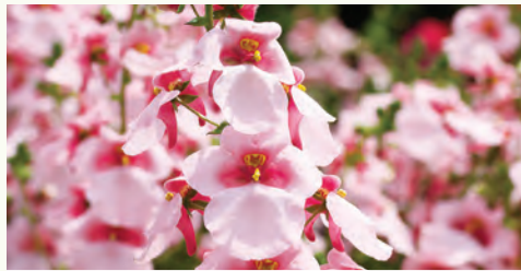
MARSHMALLOW Appleblossom PPAF

Bright brick-red flowers, slightly more vigorous.