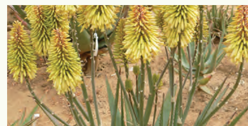
ALOE Moonglow PPAF