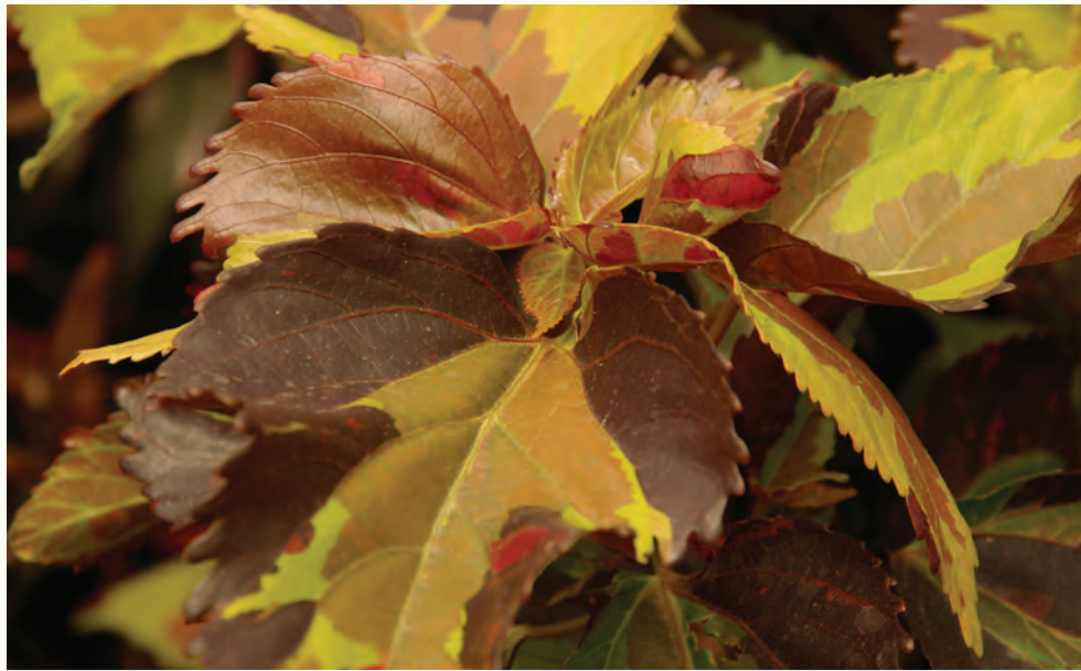
ACALYPHA TIKI Jungle Cloak