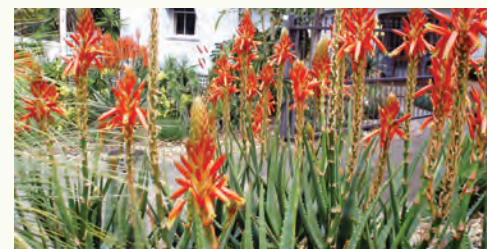
ALOE Always Red PPAF