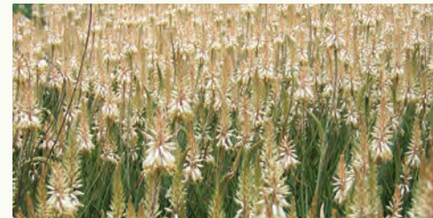
ALOE Fairy Pink PPAF