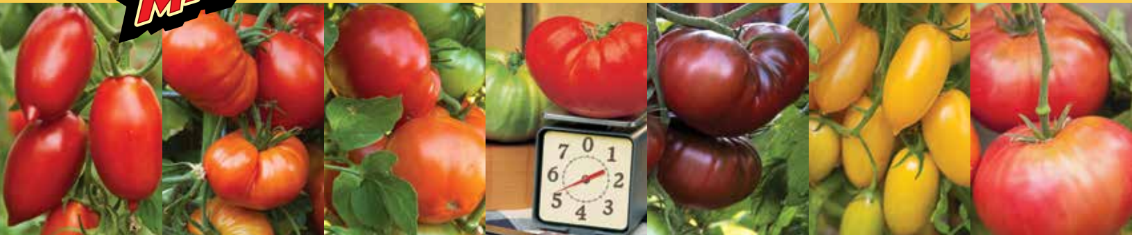
Left to right: Amish Paste, Beefsteak, Big Beef, Big Zac, Black Krim, Blush TIGER, and Brandywine (Sudduth's)