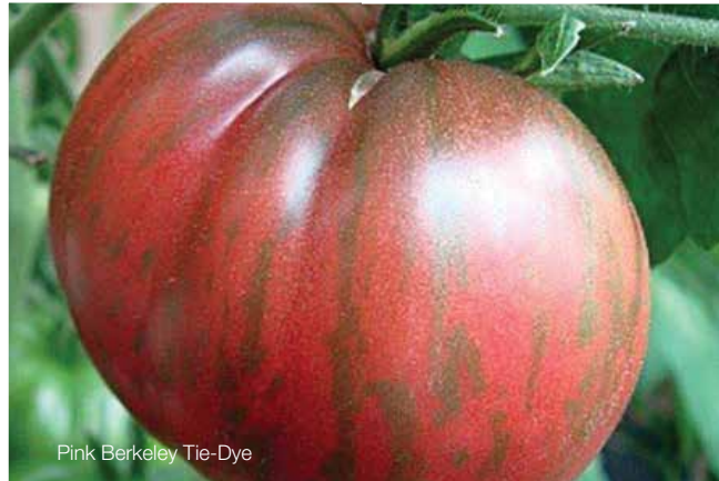
Pink Berkeley Tie-Dye