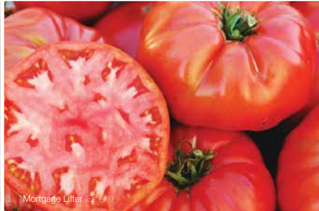
Mortgage Lifter (Ester's)