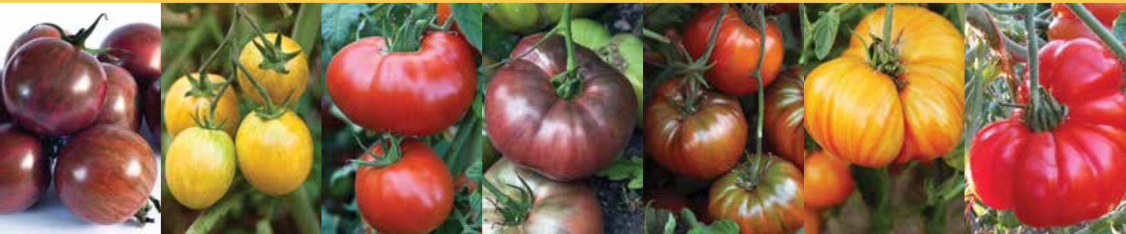
Left to right: BUMBLEBEE Purple, BUMBLEBEE Sunrise, Carmello, Cherokee Purple, Chocolate Stripes, Copia, and Costoluto Genovese

‘Early Girl’ IN 50–60 Bright red, 4–6 oz. round slicers. Early, dependable, and flavorful fruits in almost any climate. 102 , SAMP , COLL