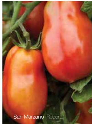
San Marzano (Redorta)